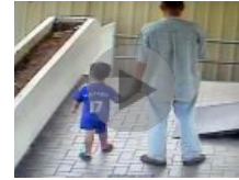
Will the real parents, please step out