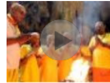
Vows to Lord Murugan fulfilled